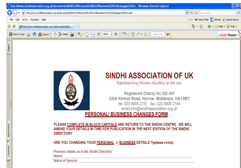
Membership area/ Change of Details form

Is your family connected to the Internet? If so, then please make sure the Sindhi Centre has your email address and full communication details. You can download a 'Change of Details' form from www.sindhiassociation.org by clicking on the Membership area.